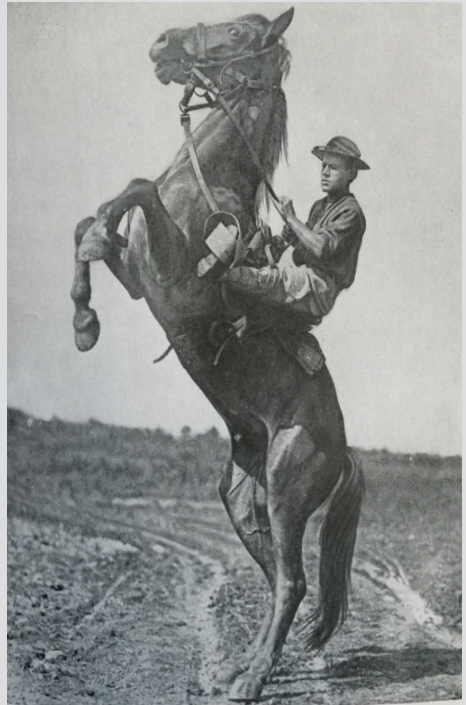
Empey serving in Texas with the 11 th U.S. Cavalry, 1911.