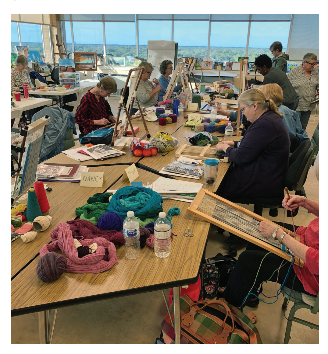
Figure 2.13 Weavers of Orlando workshop, Winter Park, Florida, 2018

anticipation about where the journey we're about to embark upon will take us—even if it's only a few days we'll be spending together, immersed in the wonders of image making and tapestry weaving.