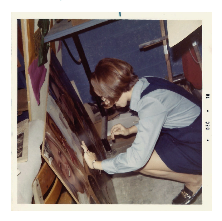
Figure 2.3 Gainesville High School art student, 1970