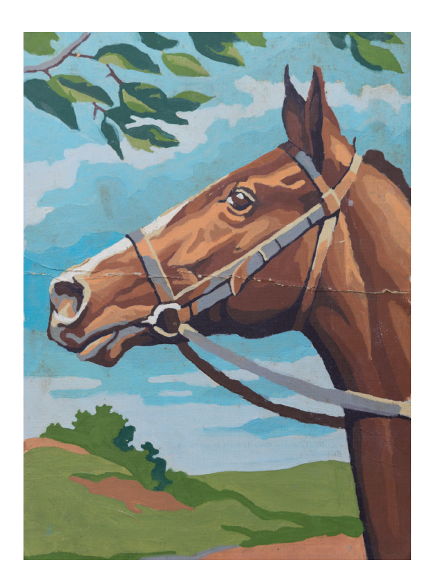
Figure 1.2 Paint by numbers horse

As long as I can remember, I've wanted to draw pictures. As a child, I heard others say I was the "class artist," and that encouraged me to think I could be a real artist when I grew up. What I thought an artist did was pretty limited since there wasn't an art program in the rural North Georgia schools I attended. Even so, kids in our class happily cut out stenciled holiday decorations for each season that we then colored with crayons and taped to windows and doors. We drew with pencils on our lined notebook paper to illustrate reports. And in our spare time, several of us girls drew horses and pretty dresses while some of the boys filled pages with elaborate battle scenes between cowboys and Indians.