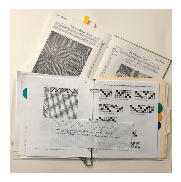
Figure 2.6 Weaving drafts in Davison book and later examples of drawdowns

ways that showed how they cared about both their students and the processes of conceptualizing and making art.