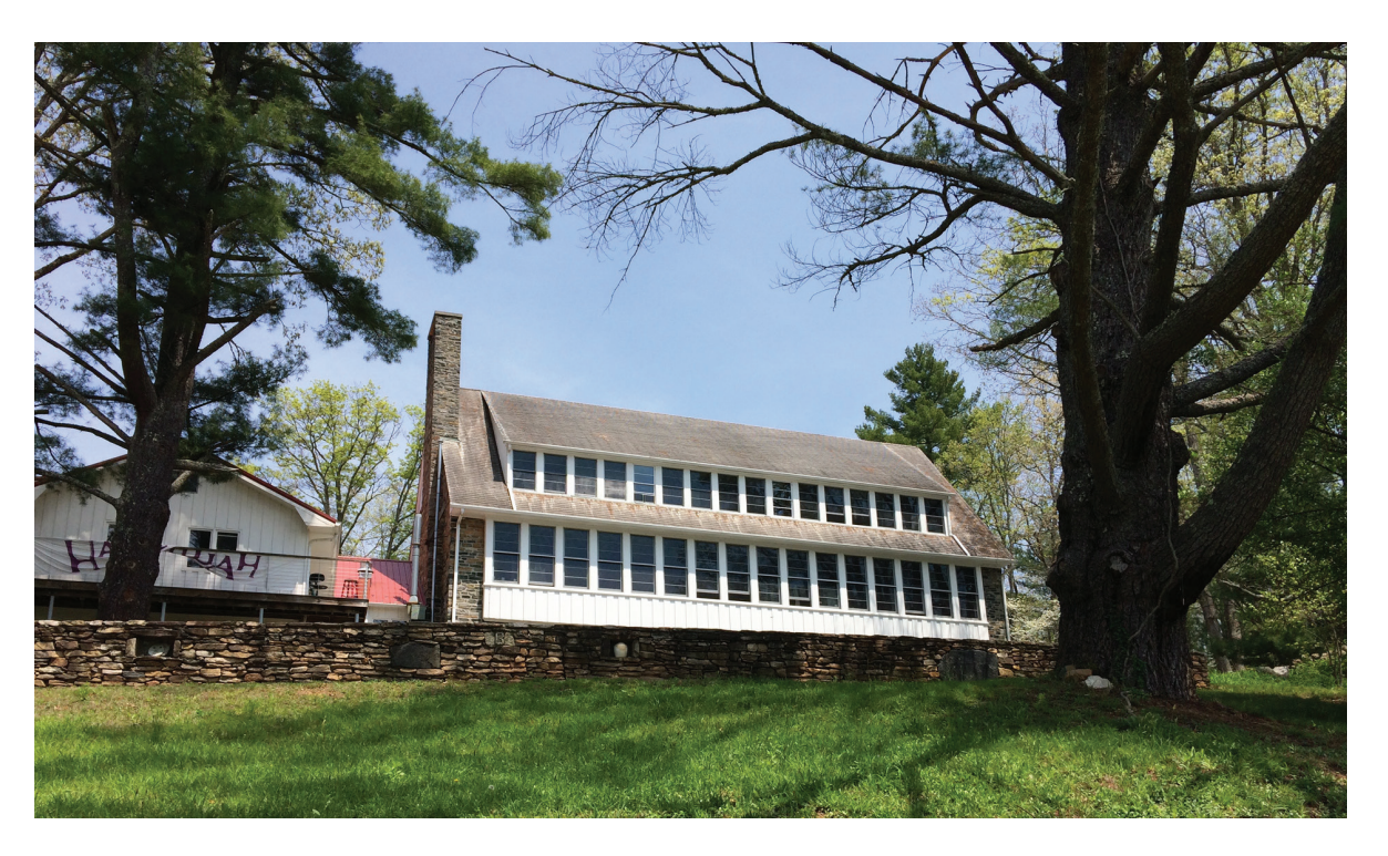
Figure 2.5 Penland—Lily Loom House, 1975

Looking back on my teaching style, I realize that most of it didn't come from the classes in art education in the university degree program. Instead, much of what I understand about teaching came from having a few exceptional teachers as my role models. Each of those had calm, patient