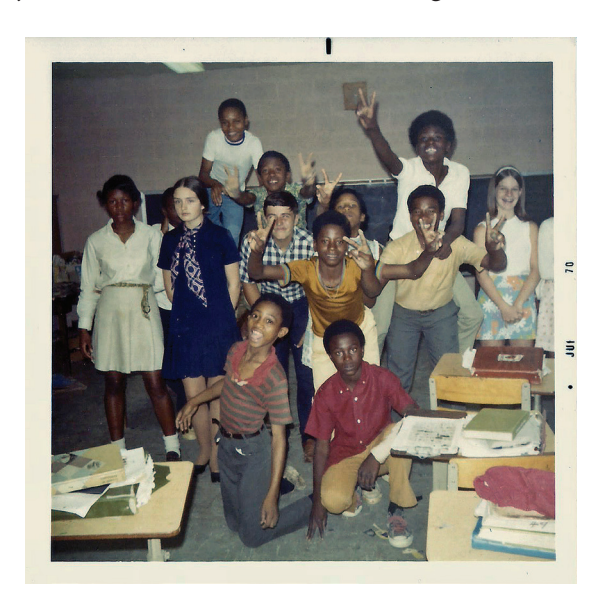
Figure 2.1 Fair Street School, 7th grade art students, 1970

The three years I spent in middle and high school art classrooms right after graduation offered many pieces of the larger teaching puzzle I began putting together. Each day,