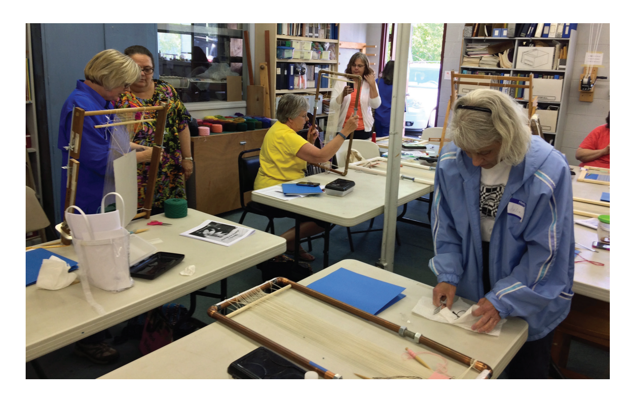
Figure 2.11 Appalachian Center for Art and Craft, Norris, TN, weaving workshop 2016

She also suggested how to set up the loom to allow for weaving in multiple layers, one on top of the other. Magic? So it seemed as I experimented with methods of double weave to create tubes and interchanged layers of the fabric.