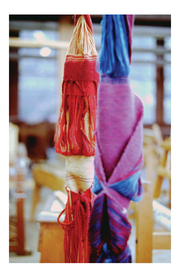
Figure 2.8 Penland—Scanlin weaving: double weave sculptural hanging, 1975

To help me understand weaving drafts Edwina pointed out a classic book that I hadn't encountered before: Marguerite Porter