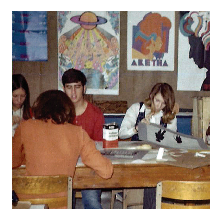
Figure 2.2 Gainesville High School art class, 1970