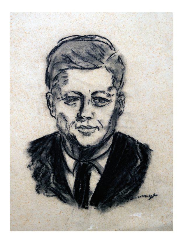
Figure 1.3 Early drawing: John Kennedy

I received encouragement for my artistic "talent" from family, friends, and teachers all through my early years in spite of no art classes being offered at school. By high school, the idea that I might actually become an artist had a strong hold on me. I was even offered a modest art scholarship at a private college. As tempting as that offer was, because of the family's limited financial means, it wasn't enough. Instead, after high school graduation, I enrolled at North Georgia College (NGC) in Dahlonega where