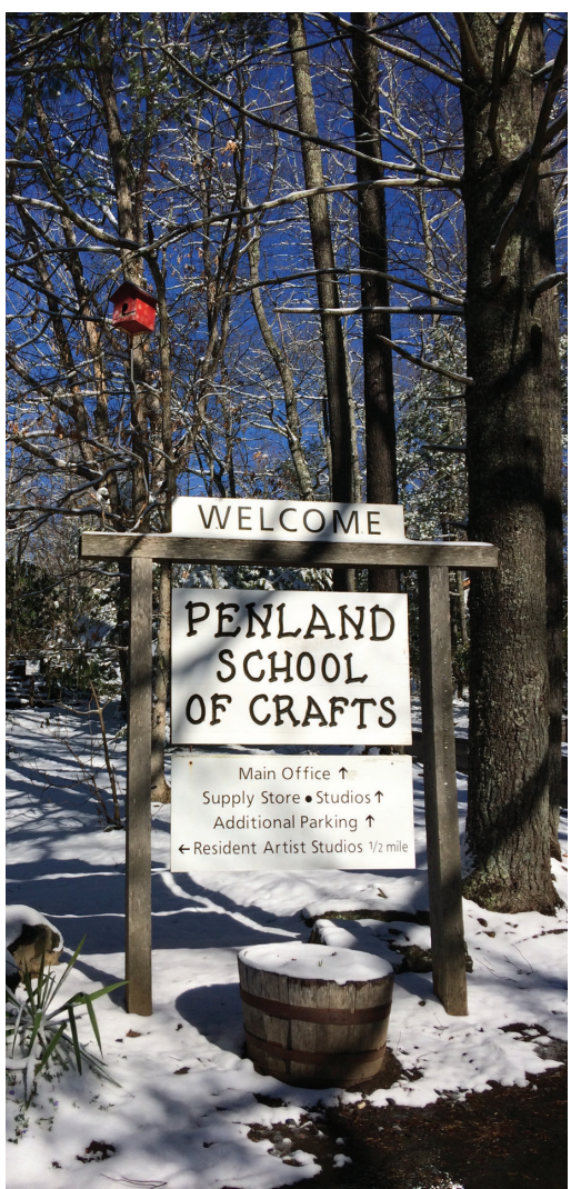
Figure 2.4 Penland sign, 1975